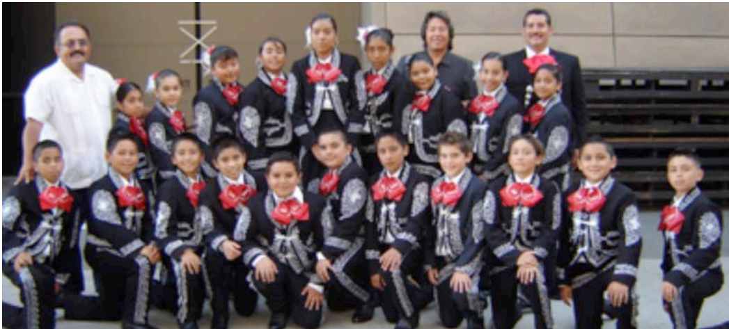
Members of the Youth and Mariachi Group that we will learn about at the November dinner meeting

Did you know that Mexico is the largest consumer per capita of Coca Cola in the world? (527 bottles, 8 oz, per person per year which is more than the U.S. 411 bottles, 8 oz, per person per year. I wonder what the difference would be in the consumption of beer.